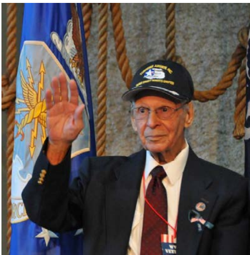
Saying good-bye to a friend.